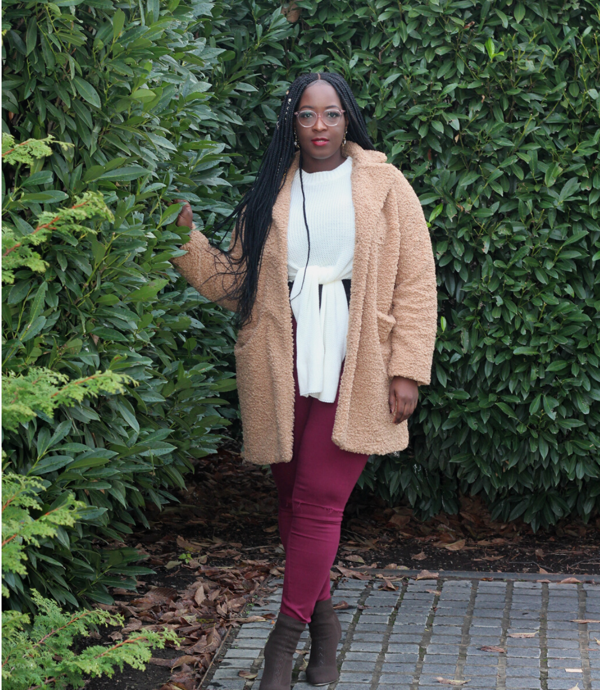
Teddy Bear Coat Item: 1039371 Retail: $159.00 www.romans.com