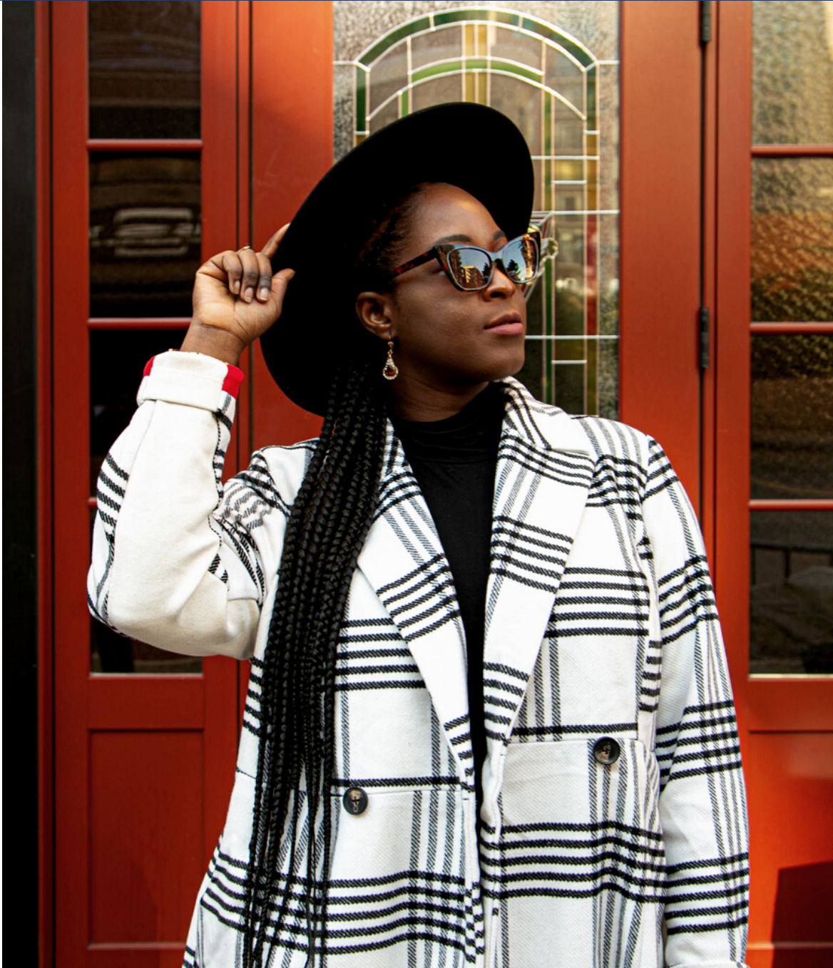
White & Black Plaid Woolen statement coat Item: 12075977 retail- $128.90 www.torrid.com